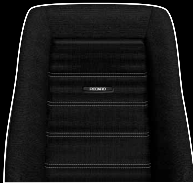
Black leather/classic corduroy