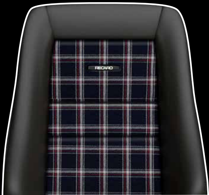
Black leather/classic checkered fabric